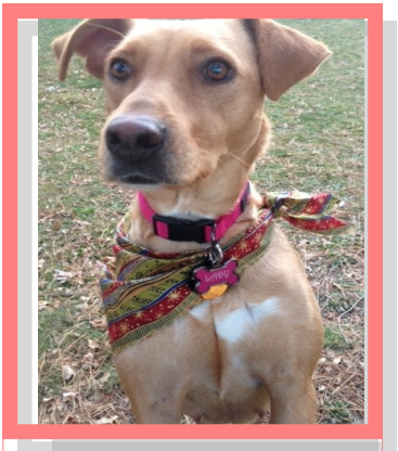
A healthy & happy Adopted Lady!