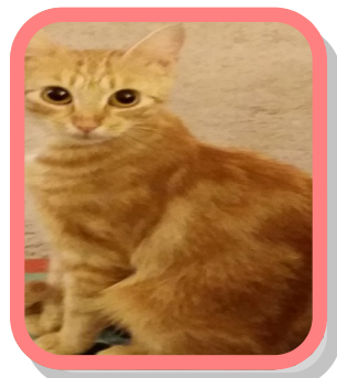
Raven before rescue