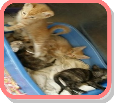
Raven's kittens rescued