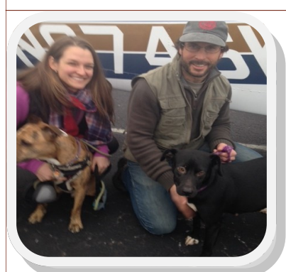
Julep flies to safety. Pregnant with pups. She touches ground.