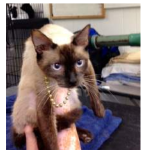
Suzuki all dressed in pearls.