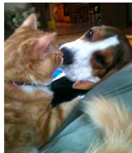
Kitty” Jethro” and his new best buddy.