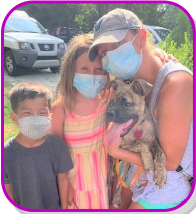
MY FUREVER FAMILY