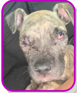
TWO WEEKS AFTER TREATMENT

When rescued, there wasn't much hope for puppy Aubie to live. He had been attacked by a dog he was with. His head was swollen to three times its normal size. At first no one was sure if he still had his eyeballs. But he seemed to follow the veterinarian staff's hand. He was covered in maggots, flies and red biting ants. He had to have surgery to get an eye lid removed and of course many types of medicines and skilled veterinarian care.